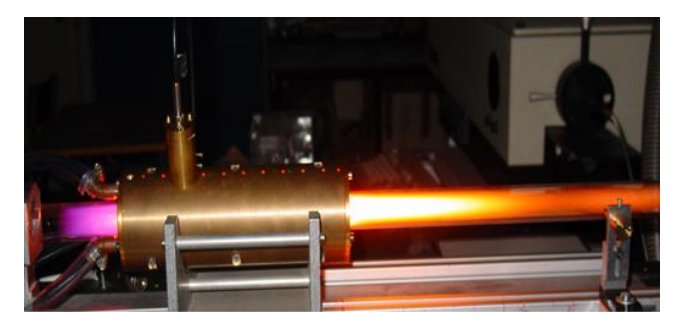
Figure 1 : Nitrogen Plasma Process

Multifunctional effects are essential for producing higher value added materials, important not only for new technical applications but also for more traditional uses. The growing environmental and energy-saving concerns will also lead to the gradual replacement of many traditional wet chemistrybased processing, using large amounts of water, energy and effluents, by various forms of low-liquor and dry-finishing processes. The dominant role of plasma-treated surfaces in key industrial sectors, such as microelectronics is well known, and plasmas are being used to modify a huge range of material surfaces, including plastics, polymers, papers, food packaging and biomaterials. In previous works, it was evidenced that cold plasma technologies can induce several surface modifications such as change in surface polarity, grafting of chemicals or deposition of functional coatings (Figs. 1&2). Such modifications are effective to confer new and durable properties to synthetic or natural polymers, without altering their bulk properties.